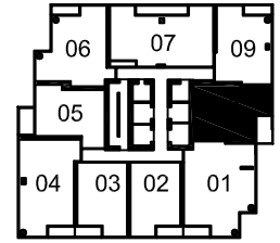
32nd - 33rd floors 35th floor 37th floor