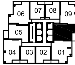
16th floor 23rd floor

716 s.f. - 16th floor 716 s.f. - 23rd floor 718 s.f. - 32nd - 33rd floors 718 s.f. - 35th floor 718 s.f. - 37th floor 718 s.f. - 38th floor